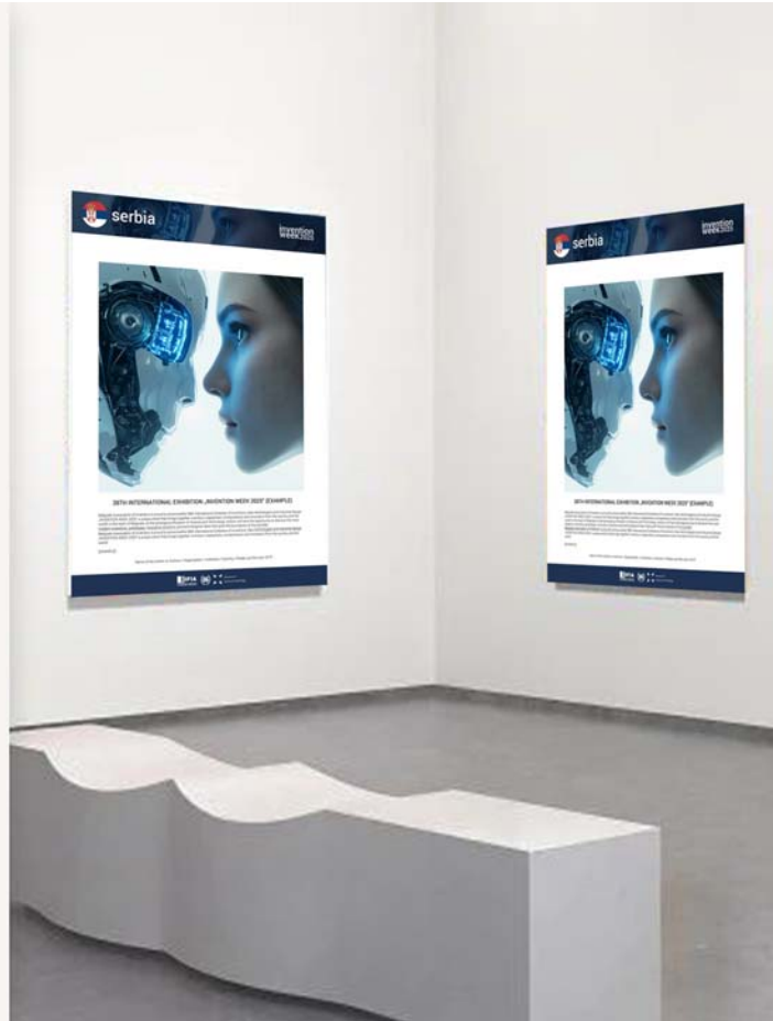
VIEW OF THE FINAL POSTER IN THE MUSEUM OF SCIENCE AND TECHNOLOGY